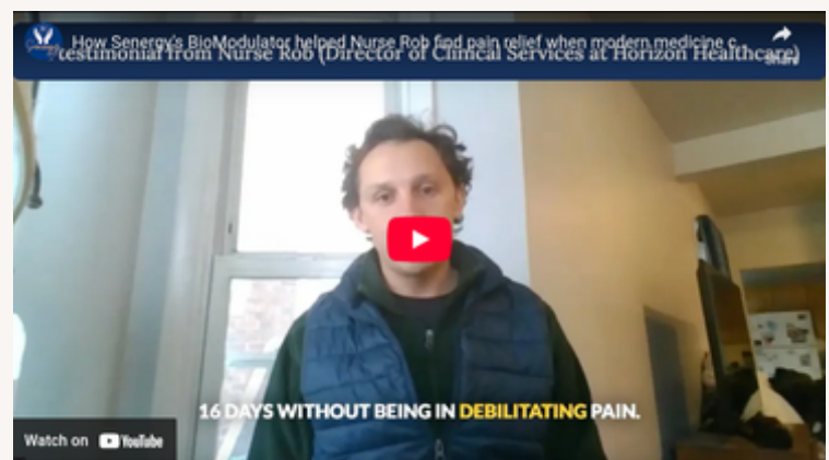
Pain relief with the BioModulator® when modern medicine failed him