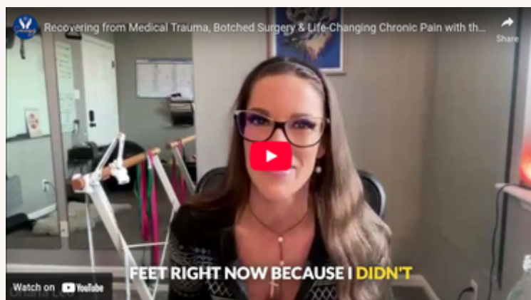
Recovering from Medical Trauma with the BioModulator®